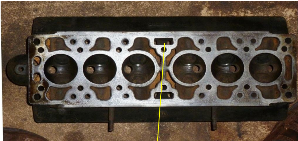
Oil drain/Camshaft centre bearing feed